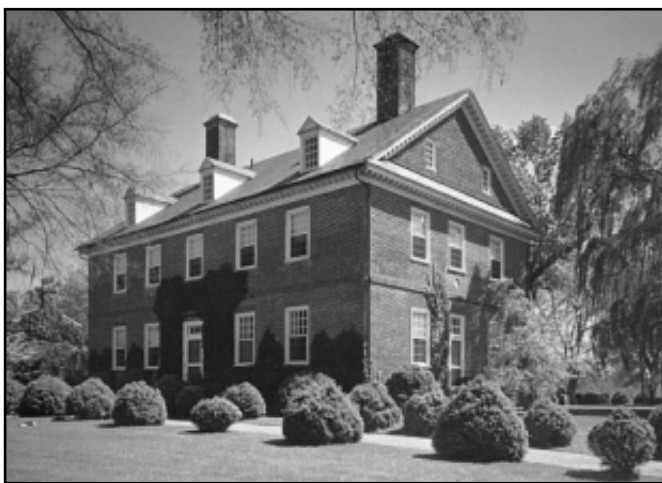
Berkeley Plantation on the James River.

Today we will look at the antebellum South and the Confederacy.