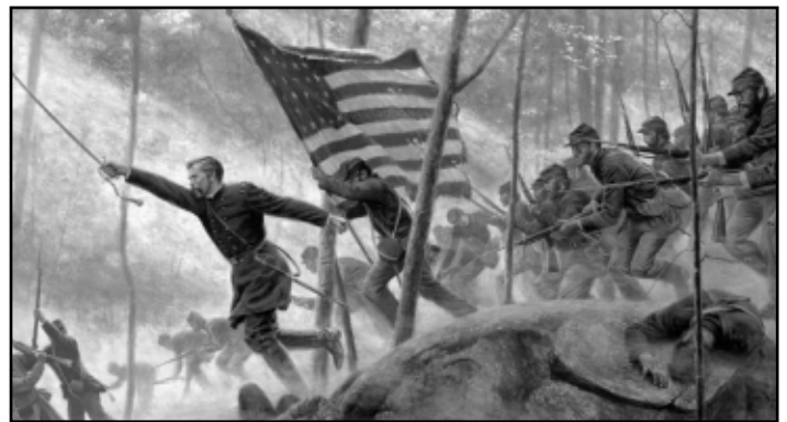
20th Maine Regiment bayonet charge at Little Round Top, led by Colonel Joshua Chamberlain. We will stand at Little Round Top. Painting by Mort Kunstler.

We’ll continue to Gettysburg, arriving in the late afternoon.