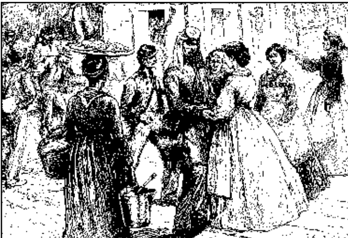
Confederate troops ready to depart for Manassas. First Manassas was the first time in history that troops were transported into battle by train.

Neither the North nor the South was prepared for war. Both sides thought that a war would be short. Union leaders believed that the Confederacy would quickly succumb to the greater resources and larger manpower of the North. Confederate leaders doubted that the northern population would be willing to fight to preserve the Union.