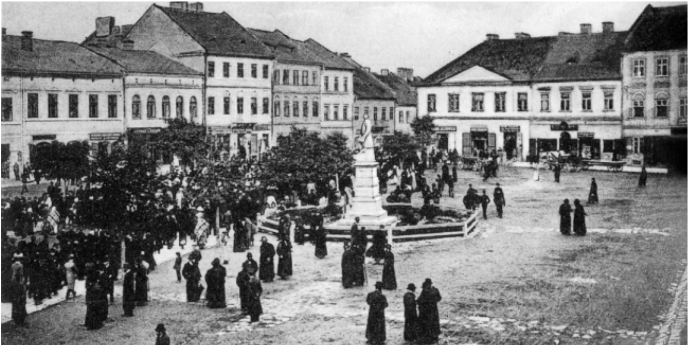
A typical market in a shtetl where Jews were the majority just before the First World War. Long black silhouettes, a statue, a few trees, a provincial square . . . a lost world.

Judaism, socially stable and unchanging despite outside influence or attacks.