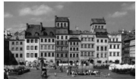
The Old Town Market Square in 1996.

NUZHNIK SYNAGOGUE – The only remaining pre-Holocaust synagogue in Warsaw