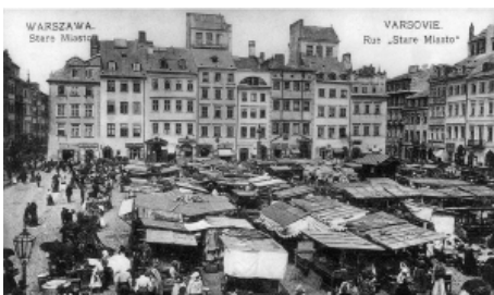
Warsaw: The Old Town Market Square circa 1912.

Today we will visit, with a local guide, the sites of Jewish heritage in Warsaw.