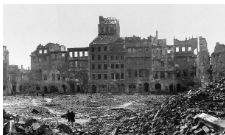
The Old Town Market Square in 1945.