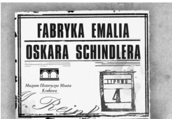
Sign of the Oskar Schindler Factory, Krakow.

Next, we will visit the museum of the former Eagle Pharmacy, owned by the only non-Jew permitted by the Nazis to be inside the ghetto. The pharmacy became a meeting place for ghetto Jews. The owner later wrote a book documenting Nazi crimes against Krakow Jews.