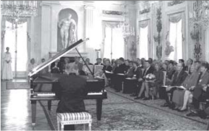
Chopin concert at Royal Lazienki Park.

After an early dinner this evening, we will be treated to a concert of music by Chopin.