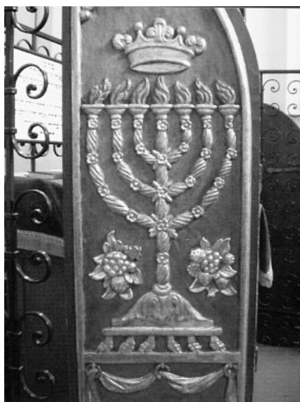
The bimah door in the Remuh Synagogue, Krakow.

offers more than 200 events – synagogue songs, Klezmer, Hasidic and classical music, lectures and workshops.