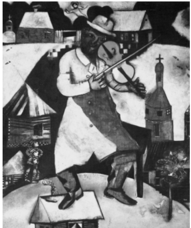
Marc Chagall, The Fiddler, 1912–13.

Klezmer began in medieval Europe as the music of the Eastern European Jews. By the 19th century, it had become a developed musical style, taking its inspiration not only from the synagogue, but also from the non-Jewish culture that surrounded it.